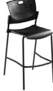
Butterfly | 809 Bar Height