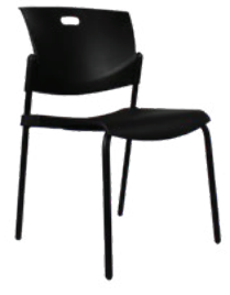
Butterfly | 808 Counter Height