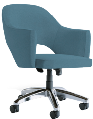
Tonik | 1100 With 5 Prong Base and Casters