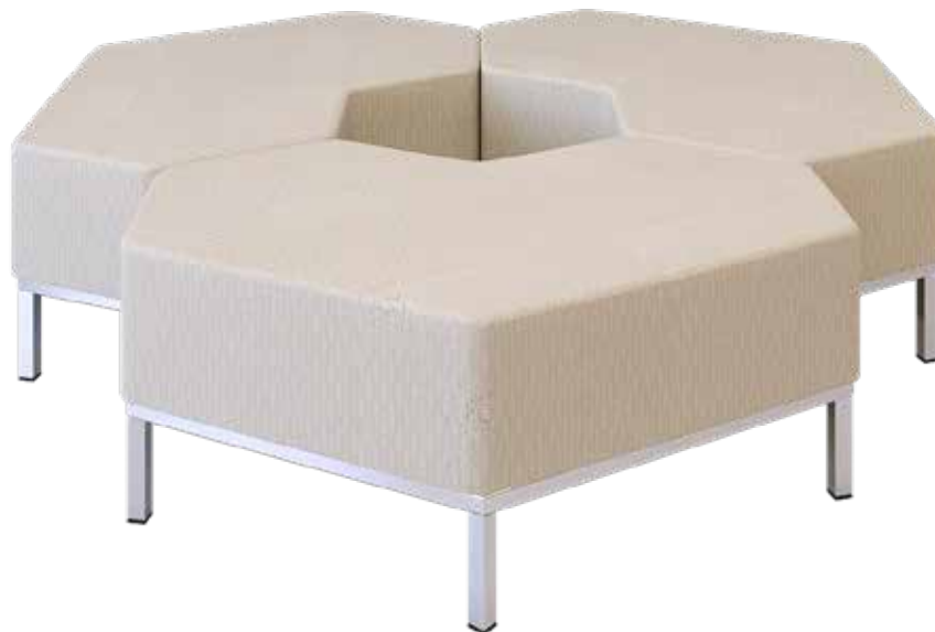
Joey 1310 (3 units)