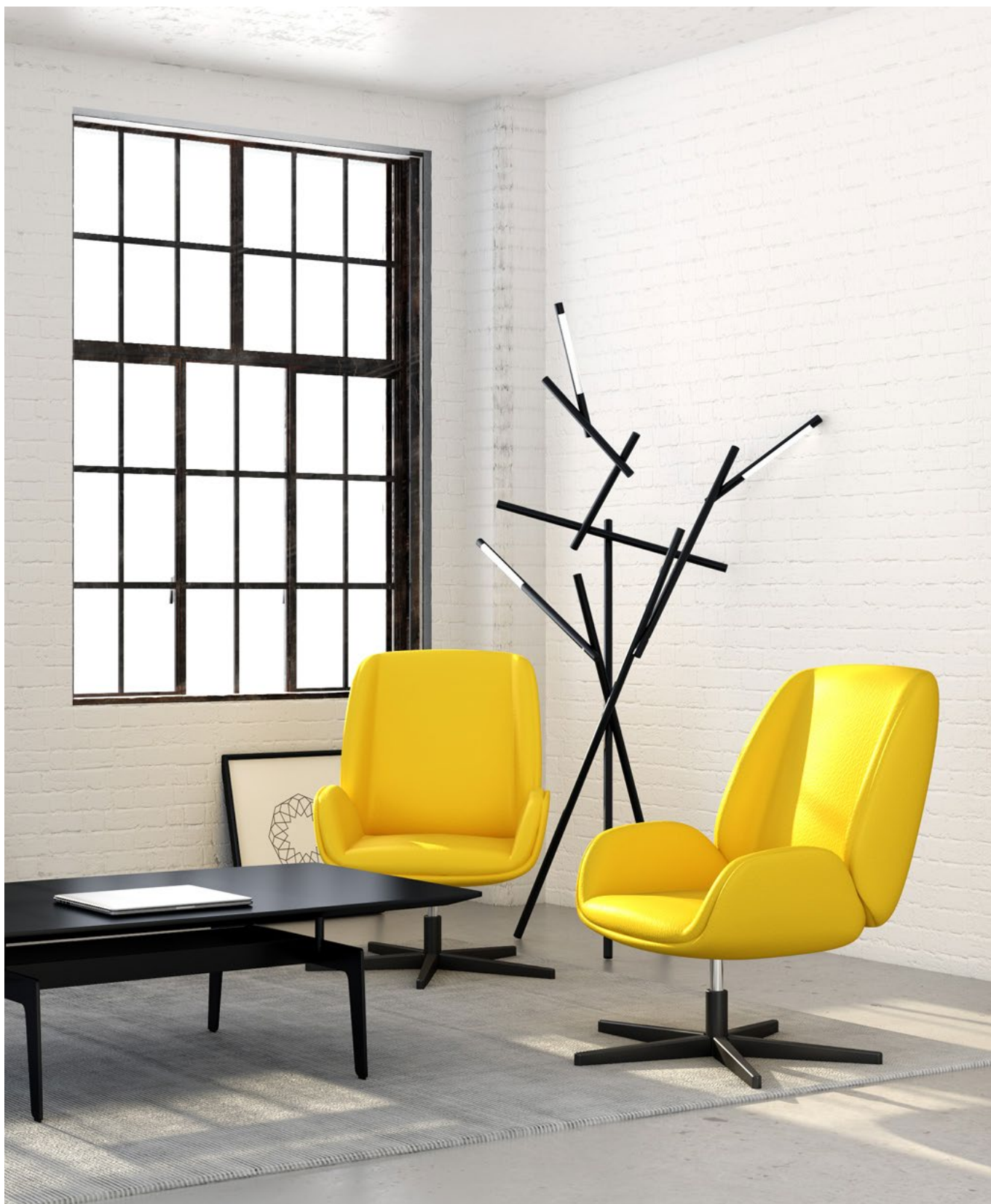
EMILY 611 LOUNGE