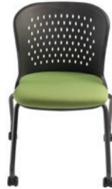
NXO | 6401UF Without Armrest