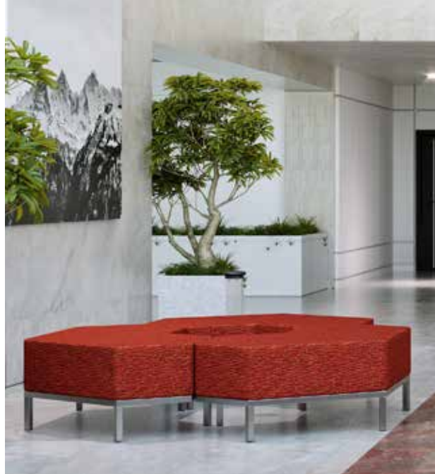
Joey 1310 (3 units)