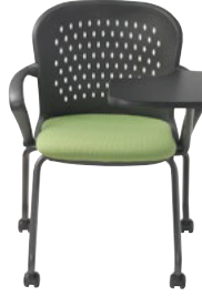
NXO | 6401UF-ATL With Armrest - Left