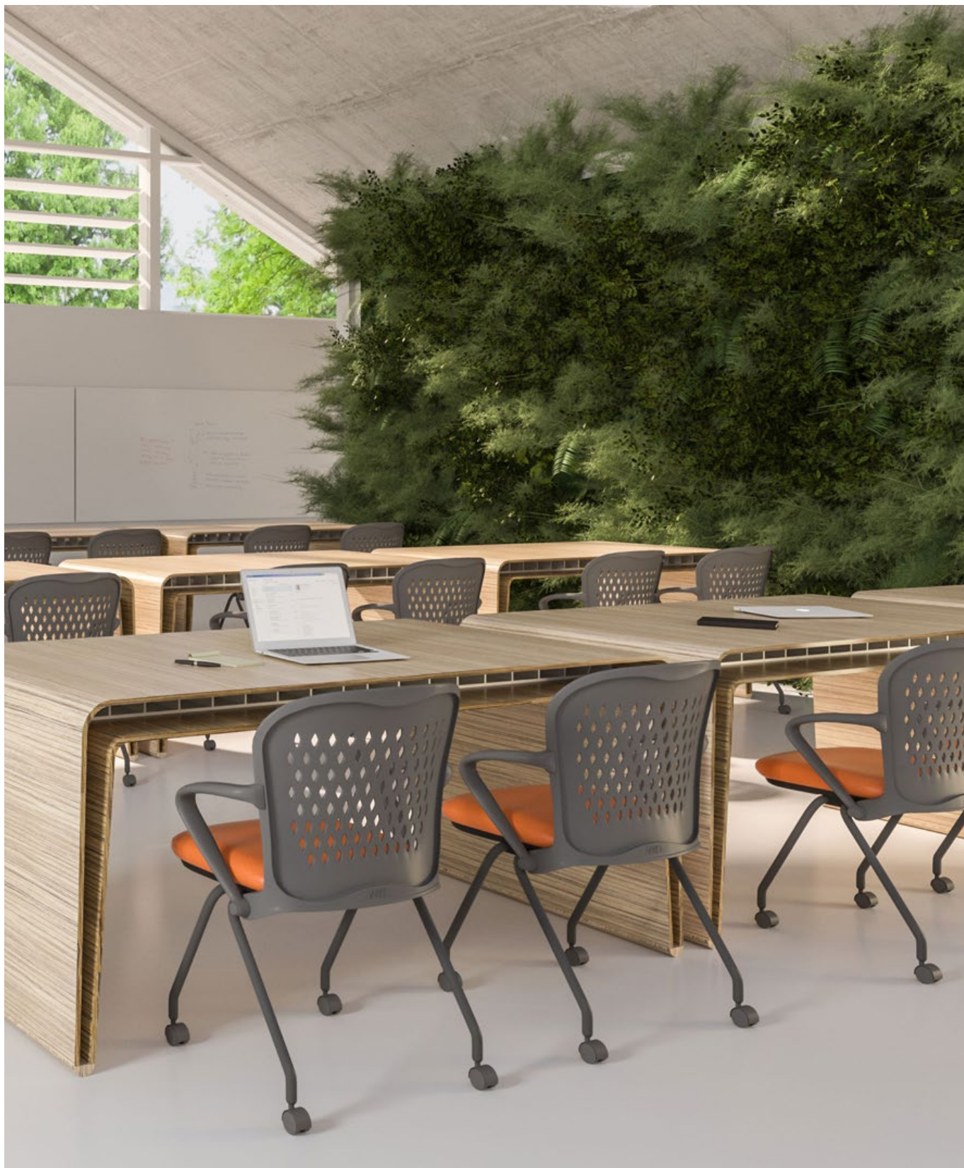
NXO 6401-TC TABLET CHAIRS