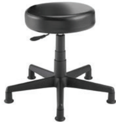
Stool | 1000GL Round