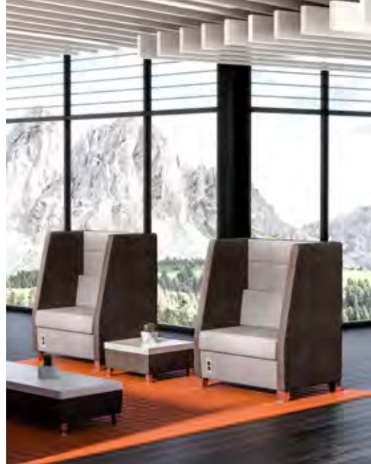
Trullo 3001-DT-EL, 3032