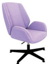
Emily | 611 Without Armrest