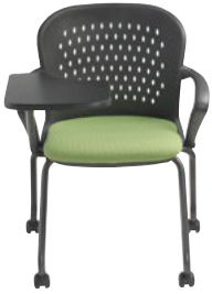
NXO | 6401UF-ATR With Armrest - Right