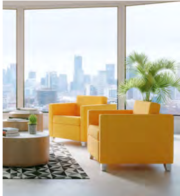
Danforth II 1221-CH