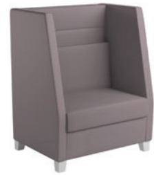
Trullo | 3001 Individual