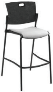
Butterfly | 810UFST Bar Height