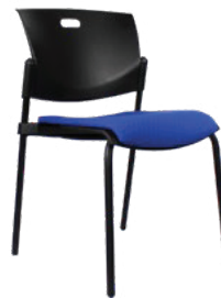
Butterfly | 808UFST Counter Height