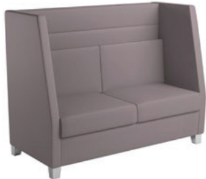
Trullo | 3002 Two Seater