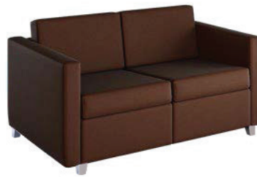
Danforth II | 1222 Two Seater