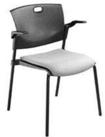
Butterfly | 811UFST Counter Height