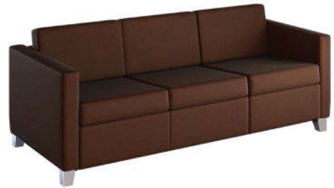
Danforth II | 1223 Three Seater