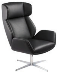
Stratford | 2001 With Armrest