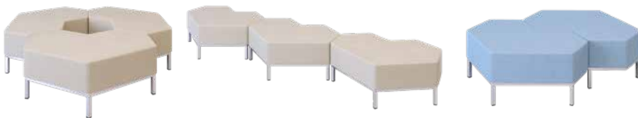
3 Units in different configurations shown in above images.