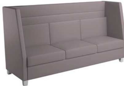
Trullo | 3003 Three Seater