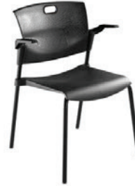
Butterfly | 811 Counter Height