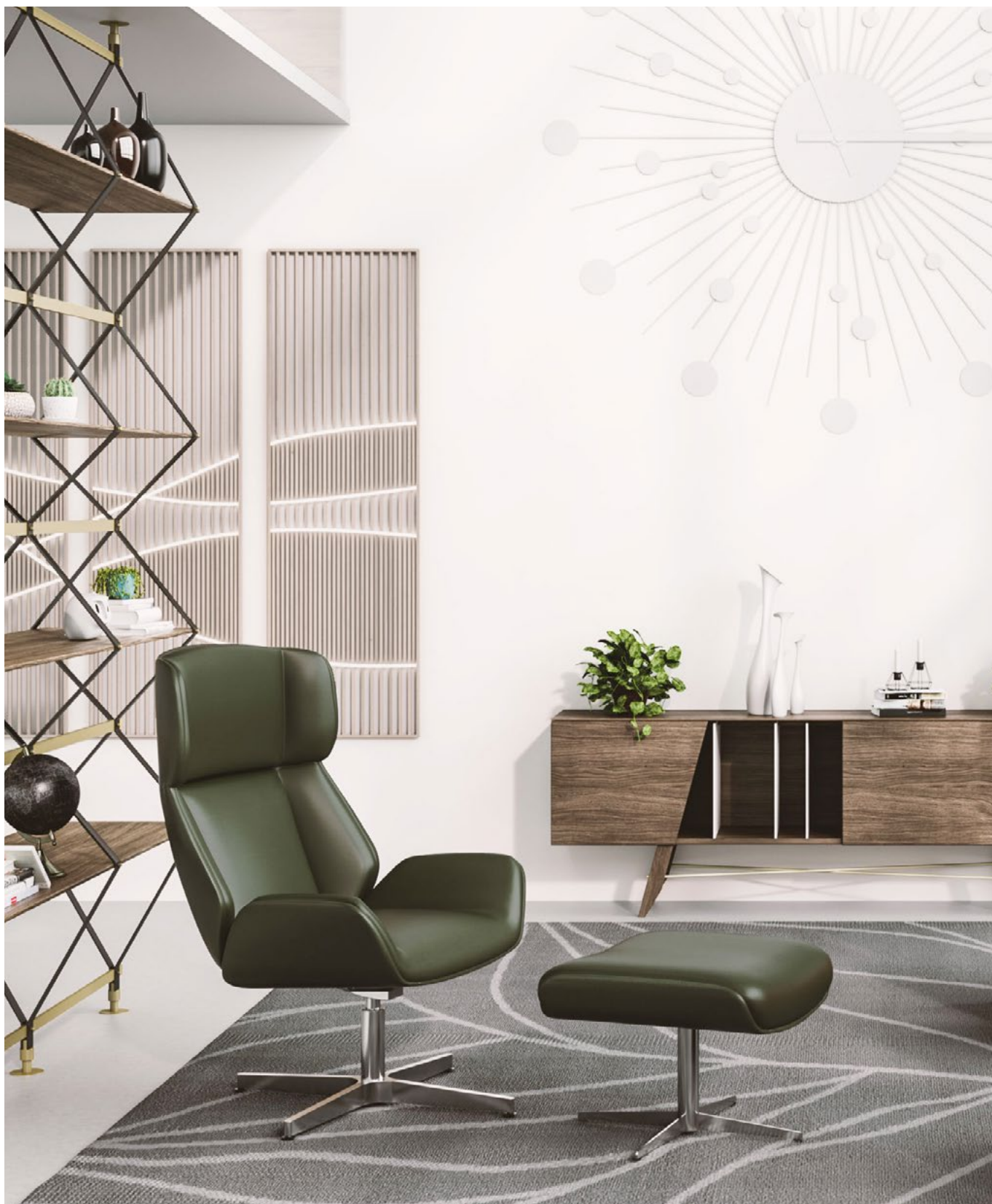
STRATFORD 2000, 2011 LOUNGE