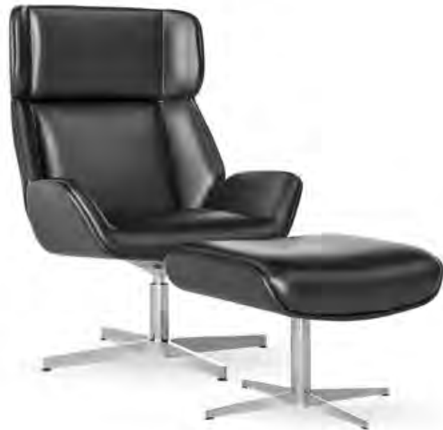
Stratford 2001 & 2011