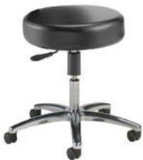
Stool | 1000RLC Round