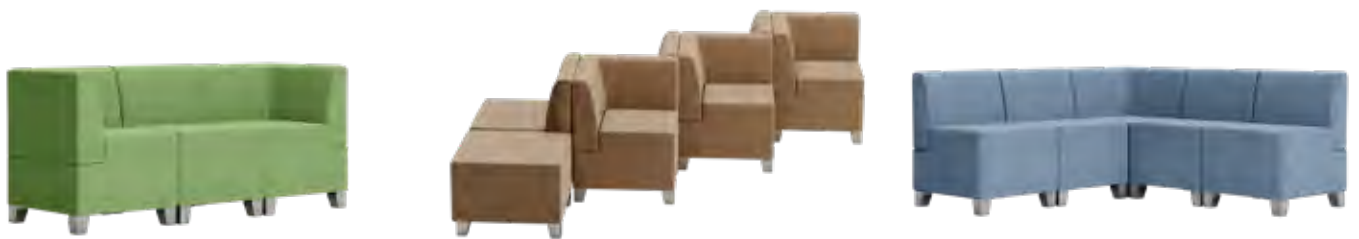
3 possible configurations shown in above images.

*When selecting Dual Tone Upholstery chair will be graded in the higher of two textiles selected.