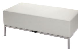
Joey | 1311 Straight Bench