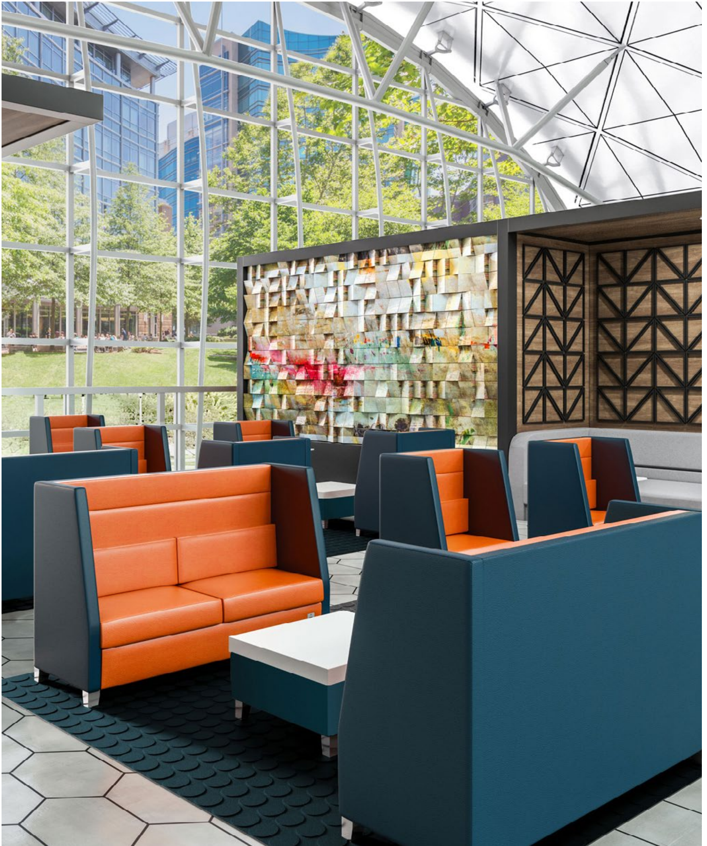
TRULLO 3001-DT-EL, 3002-DT-EL