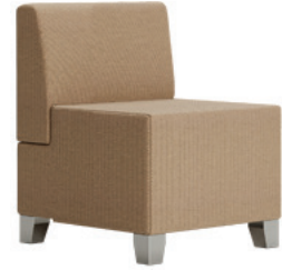
Stephanie | 1400 Medium Square