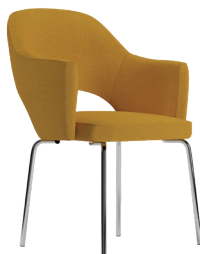
Tonik | 1101 With 4 Legged Base