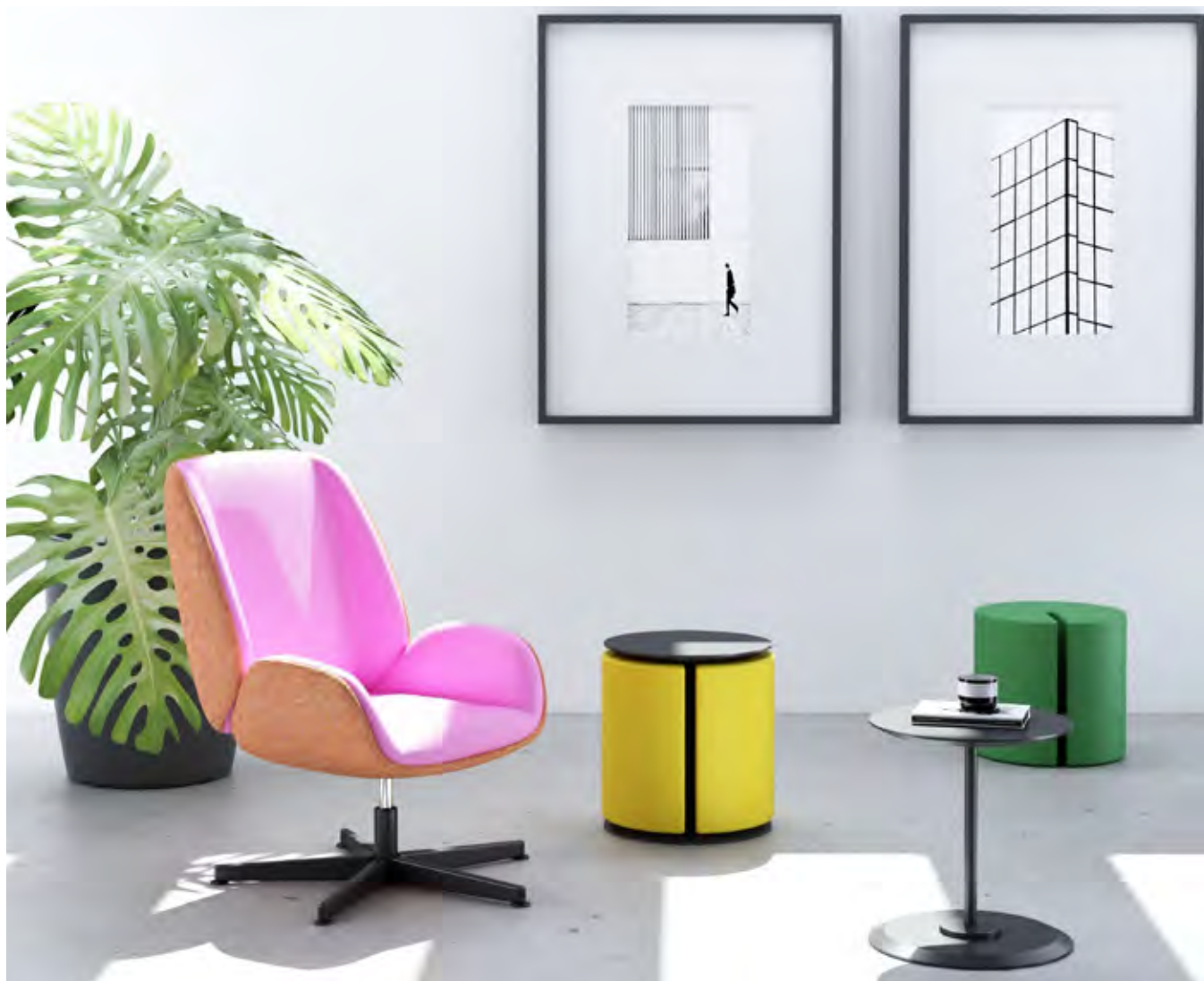
Emily 611-DT (Lounge Seat) & 610 (Stool/Table)