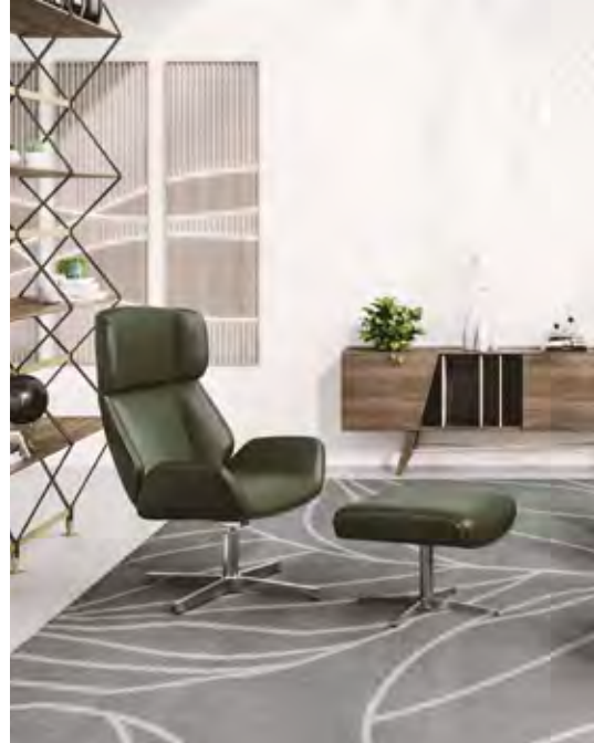
Stratford 2001 & 2011