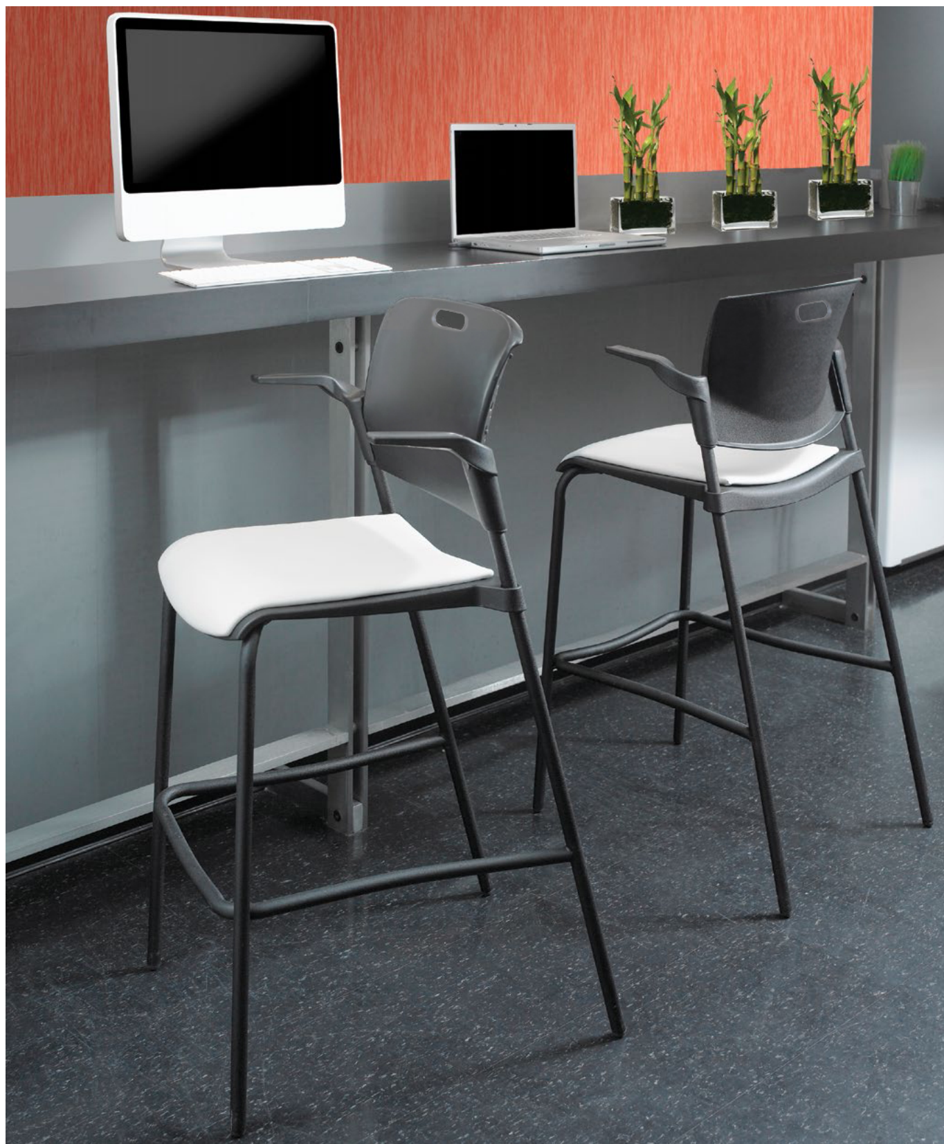
BUTTERFLY 810-UFST BAR STOOLS