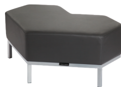
Joey | 1310 Modular Bench