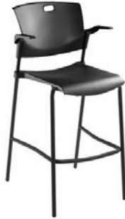
Butterfly | 810 Bar Height