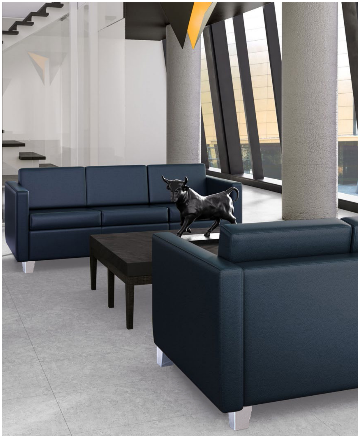
DANFORTH II 1223-CH, 1222-CH SOFA