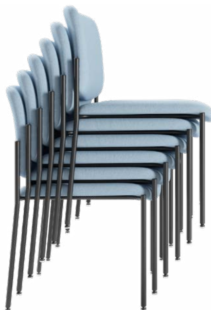
Cricket II 503 stacked 6 high.