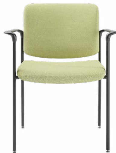
Cricket II 502