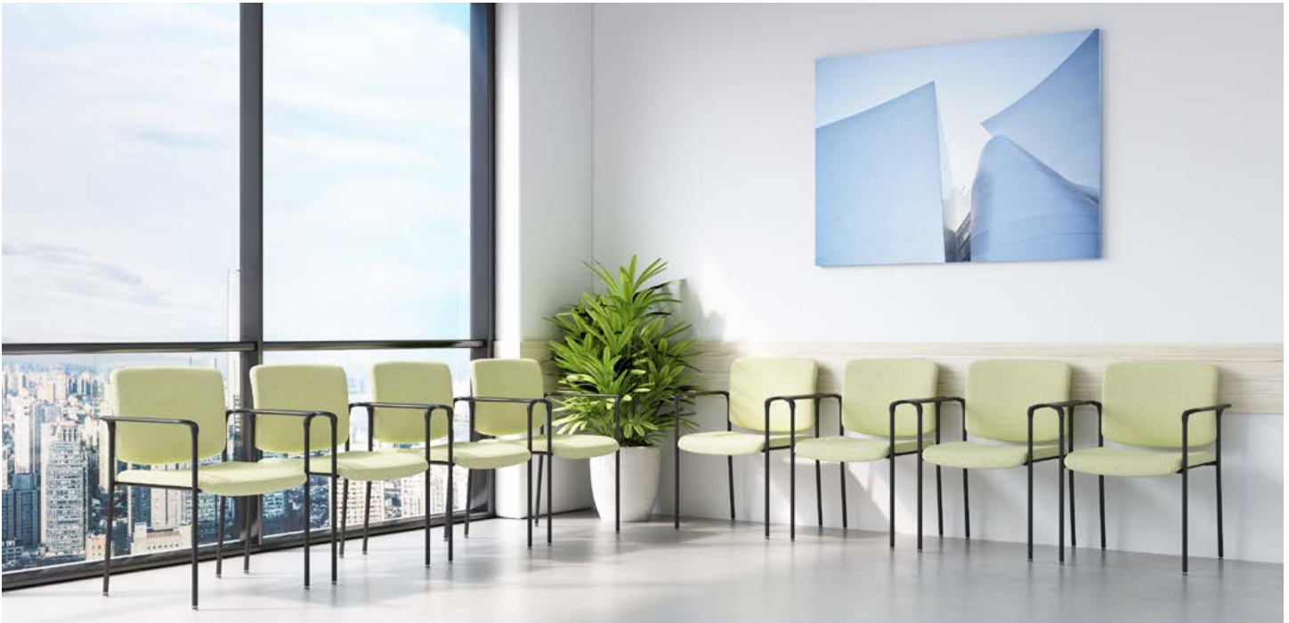
Cricket II 502