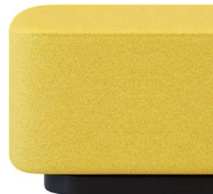
Rane 900 Milestone (Daffodil)