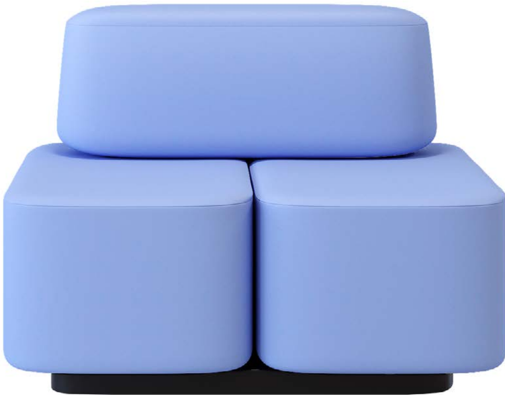
901 IRRESISTIBLE | CLASSIC COLLECTION IR06 | Sky