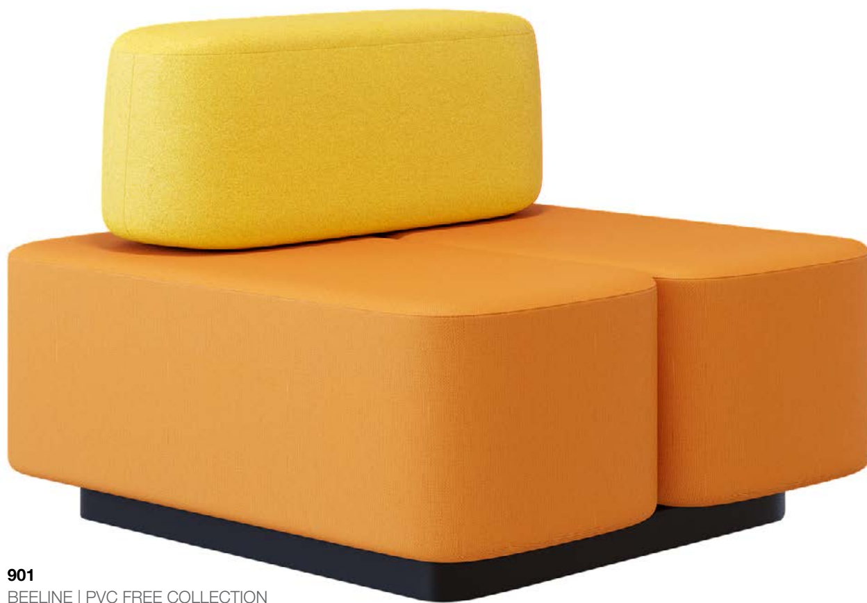
901 BEELINE | PVC FREE COLLECTION BEL16 | SISAL & BEL13 | ORIOLE