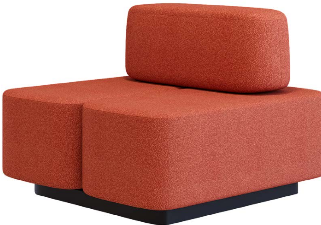
Rane 901 Basis (Amber)

Available as a single and double seater with and without back rest.