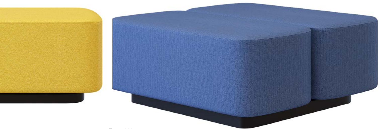
Rane 902 Moguls (Thistle)