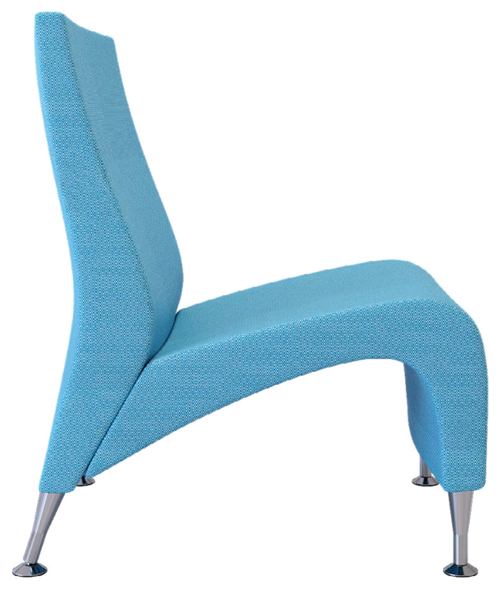
DOUGIE 830 Vox (Turquoise)

The Dougie features a unique waterfall seat design with polished aluminum legs.