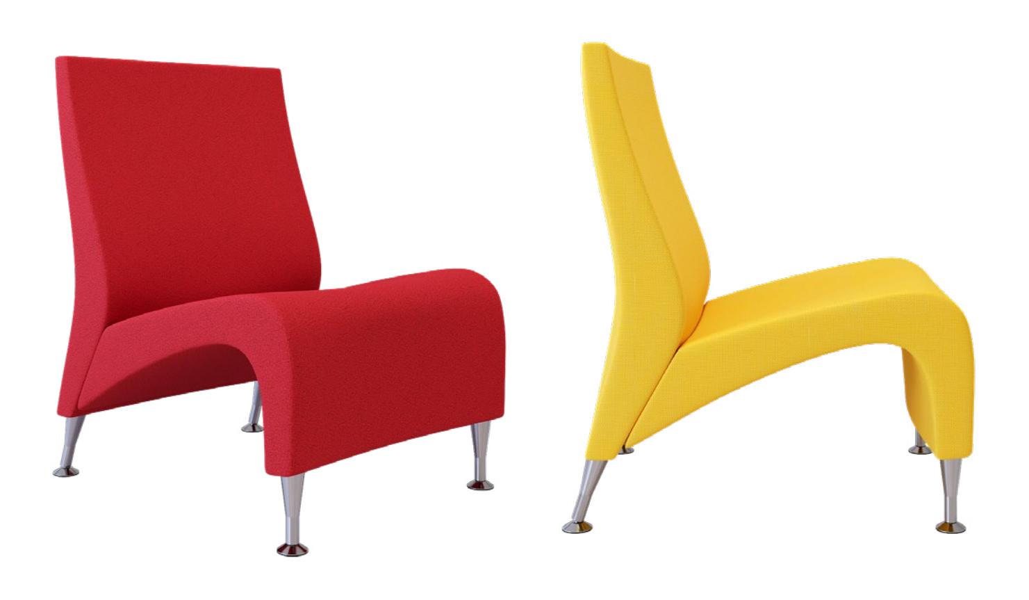
FOUNDATION / HEAVENLY COLLECTION FOUNDATION | F30 | Red