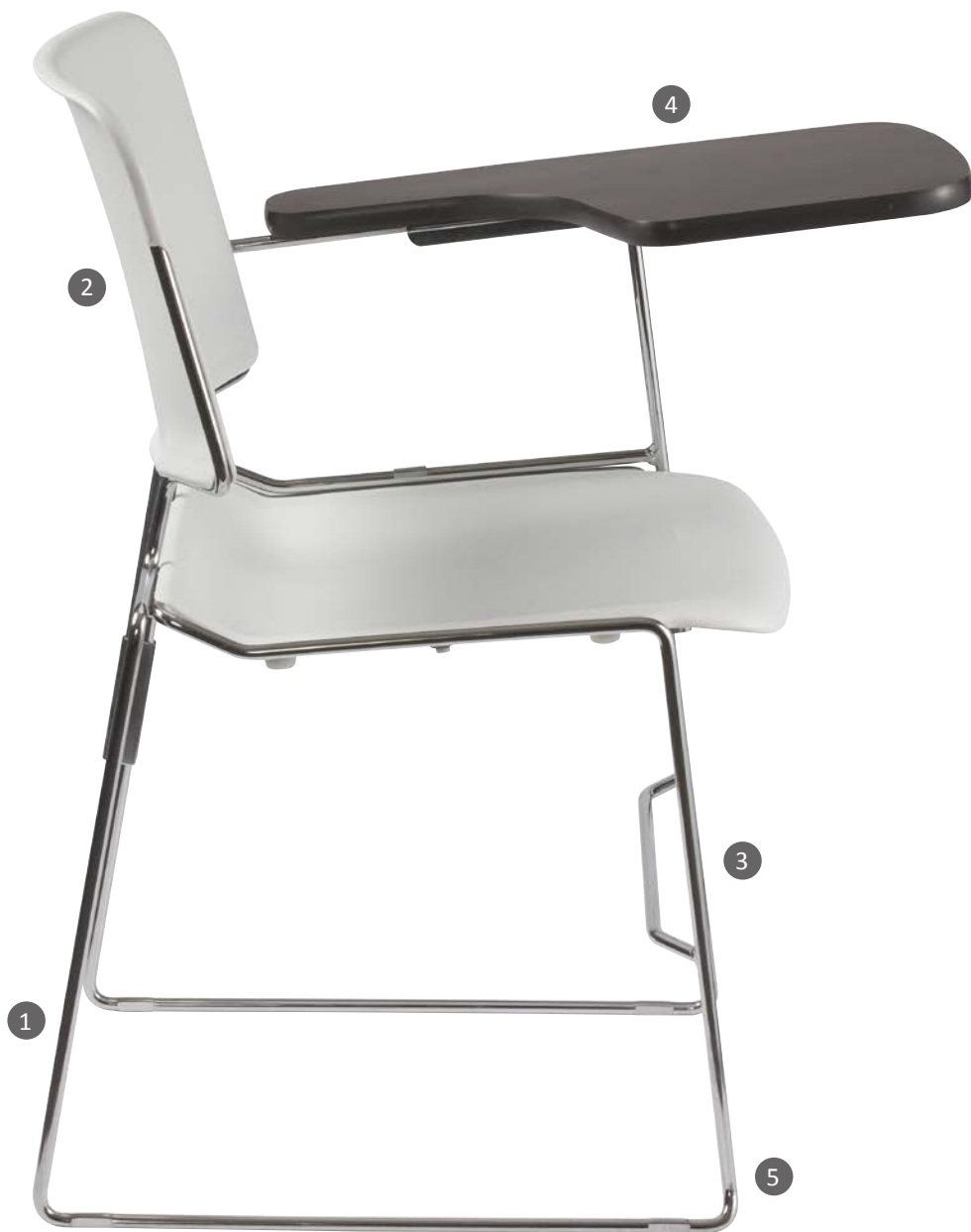
Beetle 300-ATL (White)