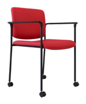
500FCA Stacker with Casters

4 leg frame with upholstered seat and back on glides Stacks 6 high free standing, 10 high on dolly.