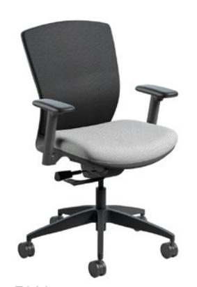
7280 Mid Back Task

5 Star Heavy Duty Nylon Base with 2" carpet casters.