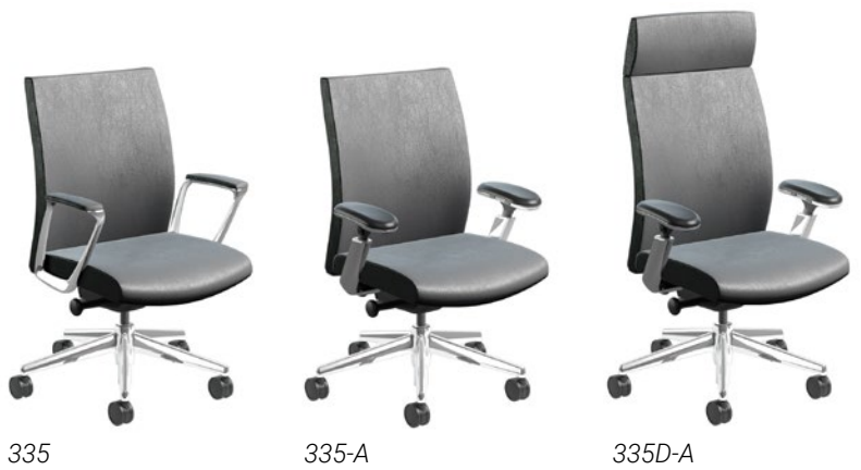
335 Mid Back Executive

Our sleek, synchro-tilt swivel mechanism features multi-position tilt lock with slow release, pneumatic height adjustment, and side tension control.