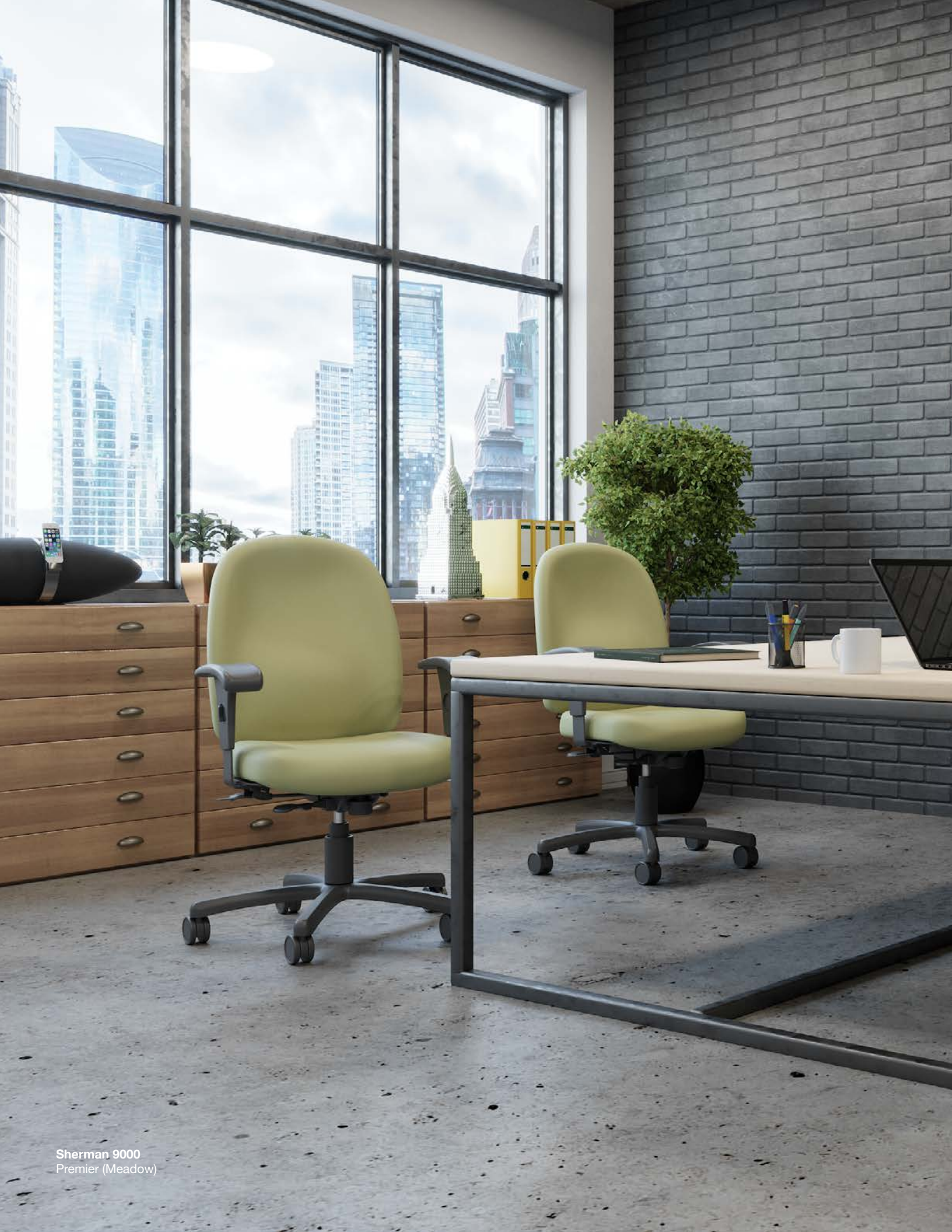
Sherman 9000 Premier (Meadow)