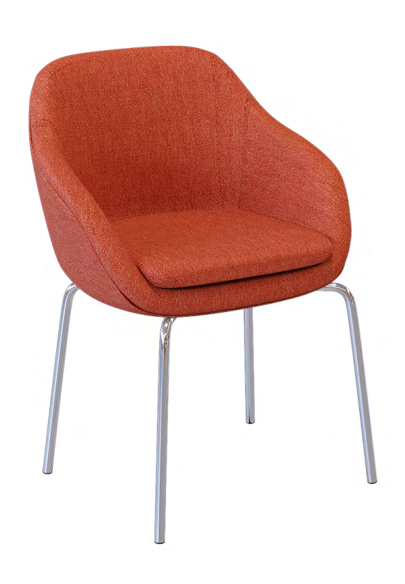
1501 BASIS | Amber