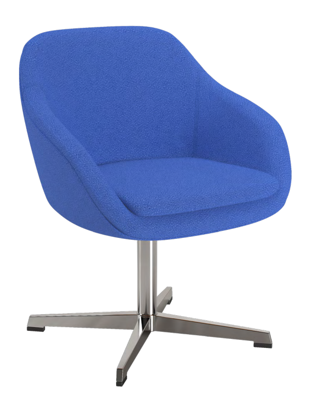
1509 BEEHAVE | Clementine