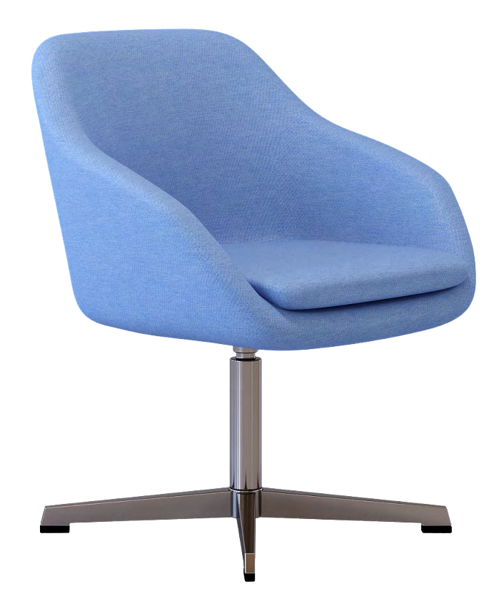
JOHNNY 1509TP Sleek chrome trumpet base.