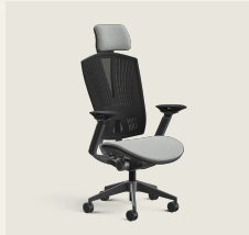
2550D UFST Mesh back mid back task with upholstered seat, adjustable headrest

Width: 27.5" Depth: 26-27" Height: 47-50.5" Seat Height: 15.9-18.5" Seat Width: 20" Seat Depth: 18-19.5" Weight: 57 lbs Volume: 16 cu ft