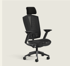
2550D All mesh mid back task chair with adjustable headrest

Width: 27.5" Depth: 26" - 27" Height: 40.4" - 44" Seat Height: 16" - 19.5" Seat Width: 20" Seat Depth: 18" - 19.5" Weight: 57 lbs Volume: 16 cu ft