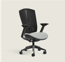
2550UFST Mesh back mid back task with upholstered seat

Width: 27.5" Depth: 26-27" Height: 40.5-44" Seat Height: 15-18.5" Seat Width: 20" Seat Depth: 18-19.5" Weight: 56 lbs Volume: 16 cu ft