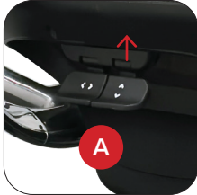
Pneumatic Height Adjustment

To lower, pull lever up while seated. To raise, pull lever up with no weight on the seat.