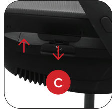
Synchro Recline/ Tilt Lock Adjustment

For Seat Depth lift lever up to unlock. Move Seat to desired position while seated and release to lock