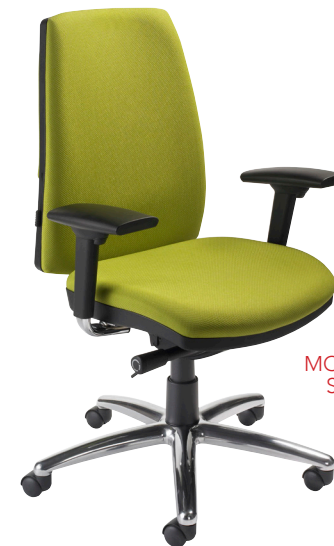
MODEL 7000 SHOWN