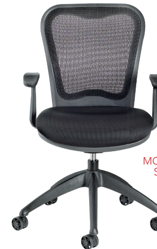
MODEL 5900 SHOWN