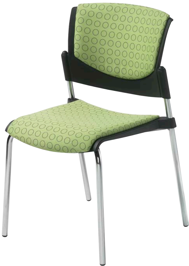
808UFST CH Model

Some options include twin wheel carpet casters, chrome legs, drafting stool and soft tile casters.