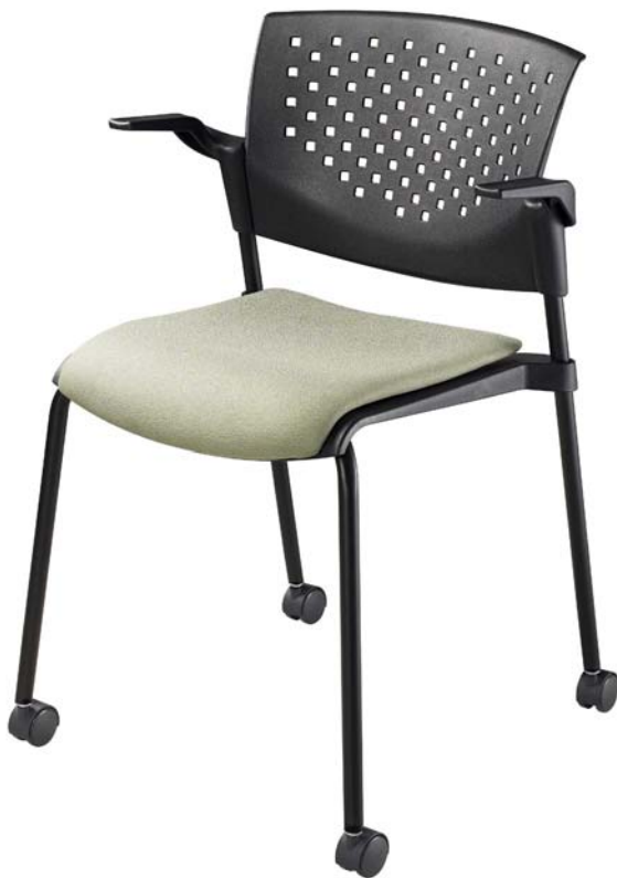
811UFST CA Model